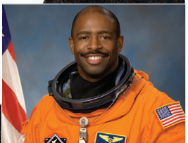
From left to right: Barack and Michelle Obama, Colin Kaepernick, Gabby Douglas, Robert L. Johnson, and Leland Melvin.