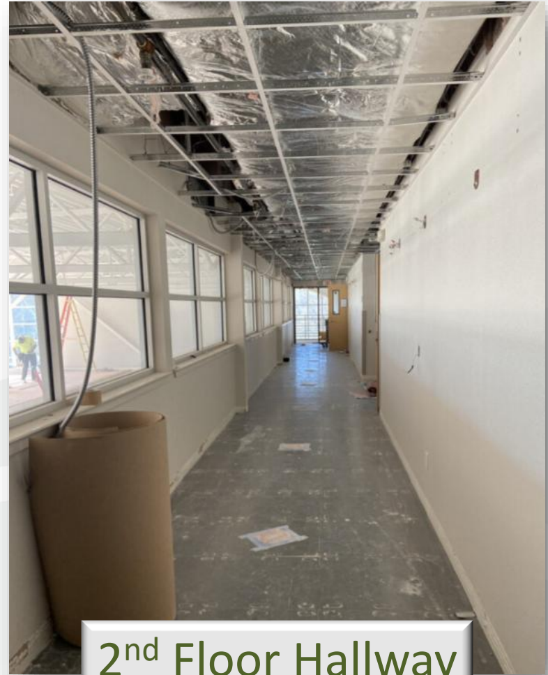
2 nd Floor Hallway