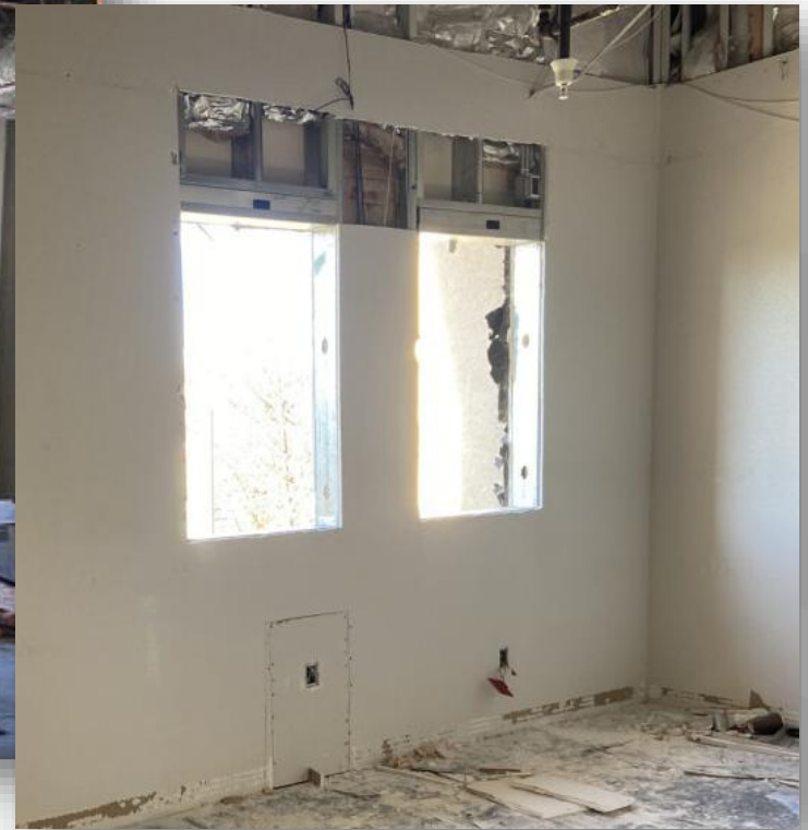
New 2 nd Floor Windows