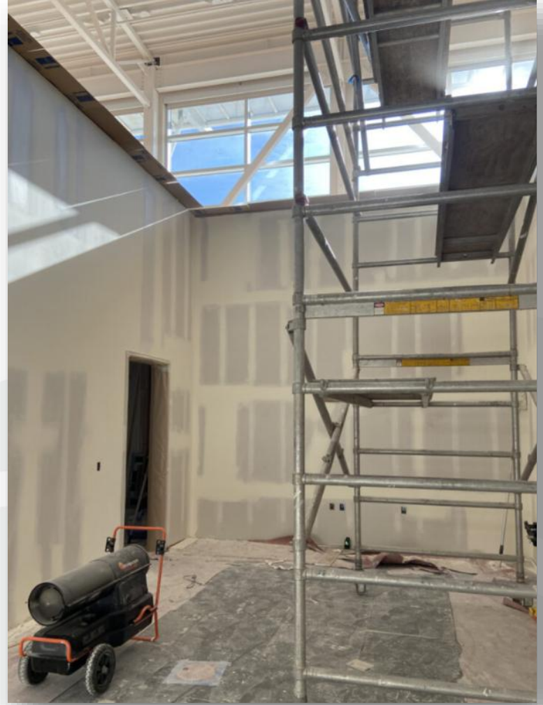
Central Areas between Office Pods