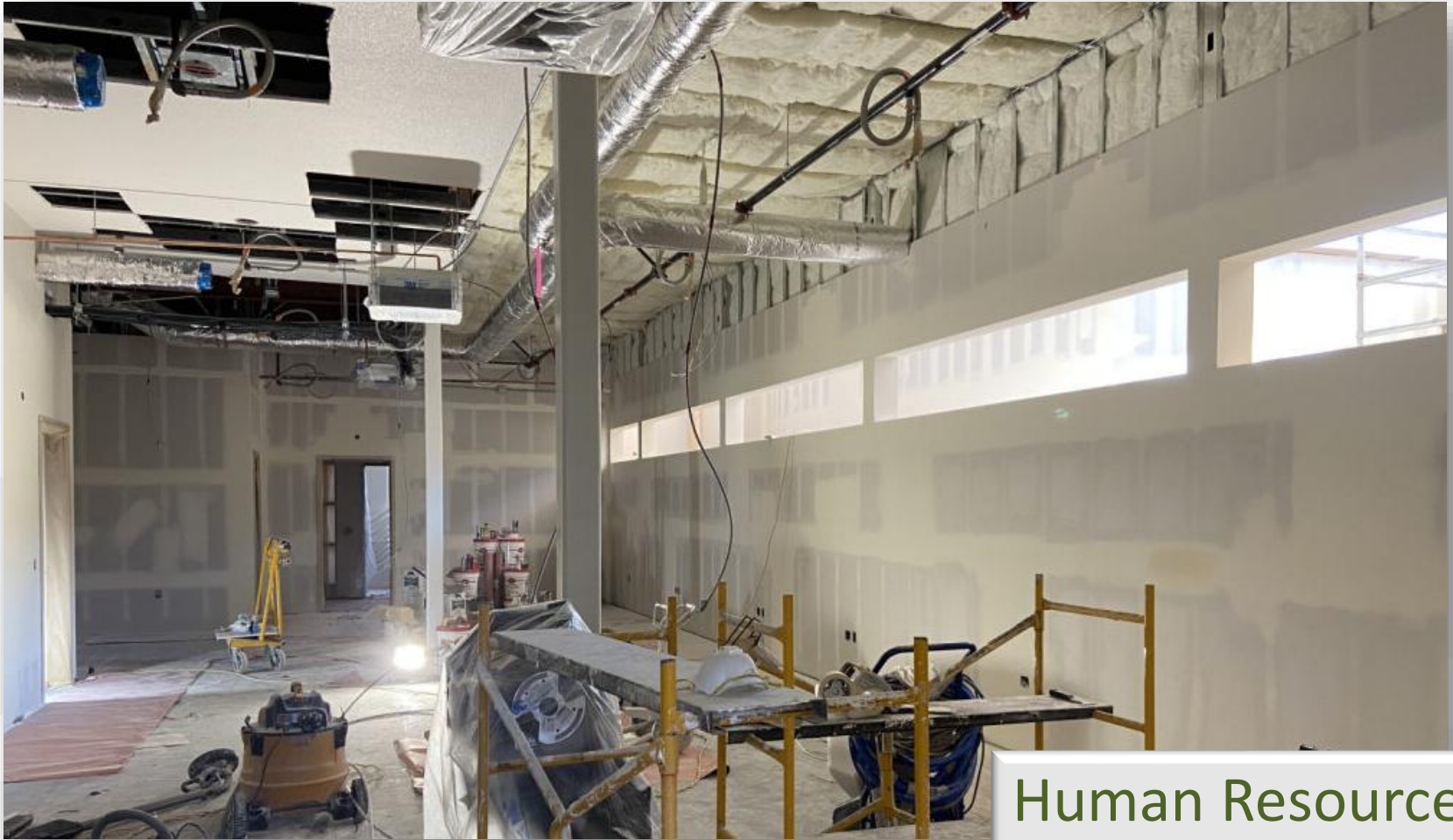
Human Resources Office