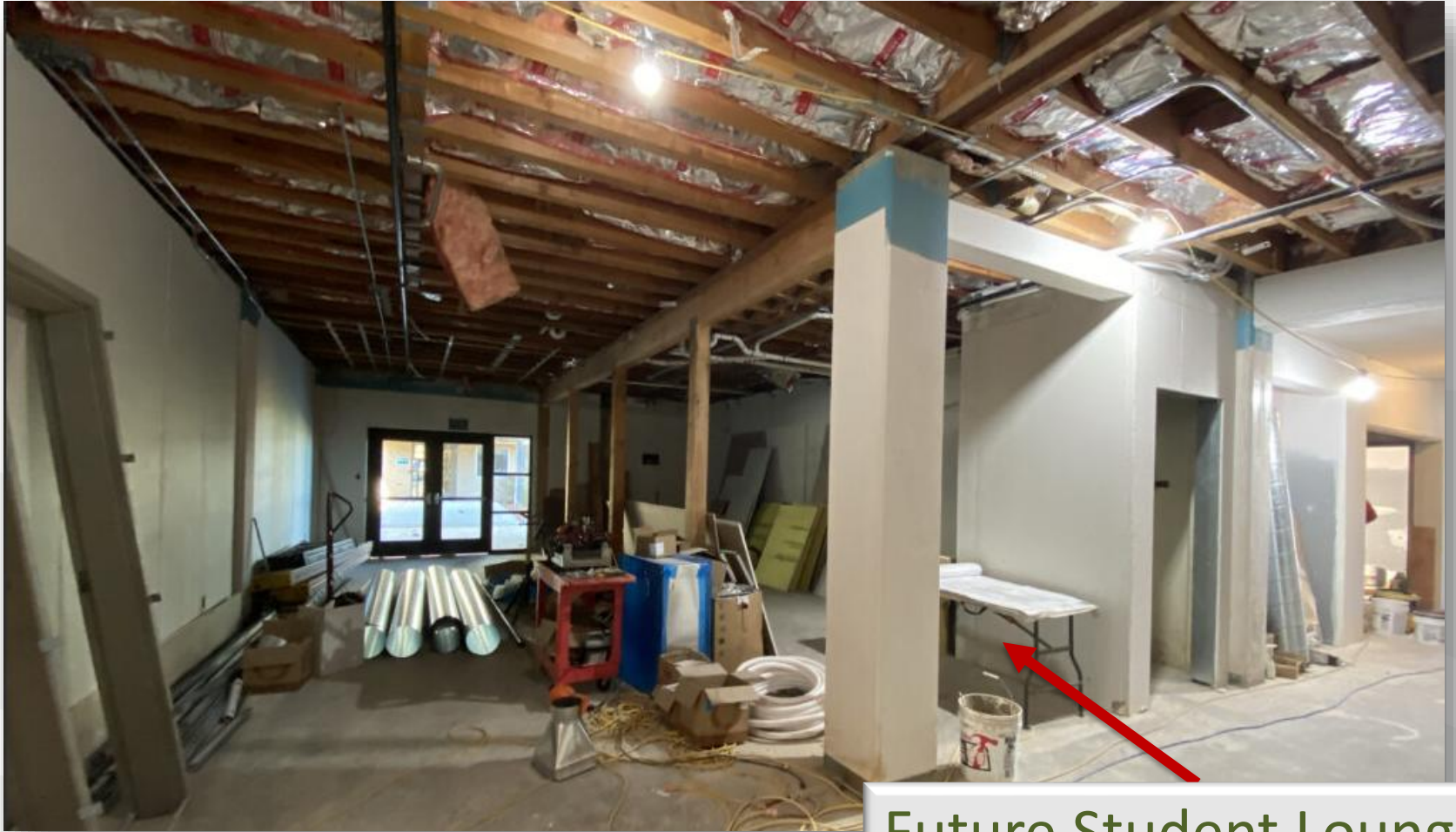
Future Student Lounge