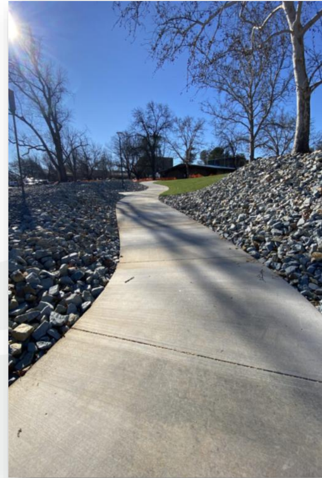
Concrete Walkways adjacent to the Sycamore Parking Lot