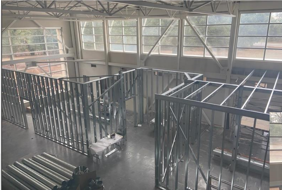
President's Office "Pod"