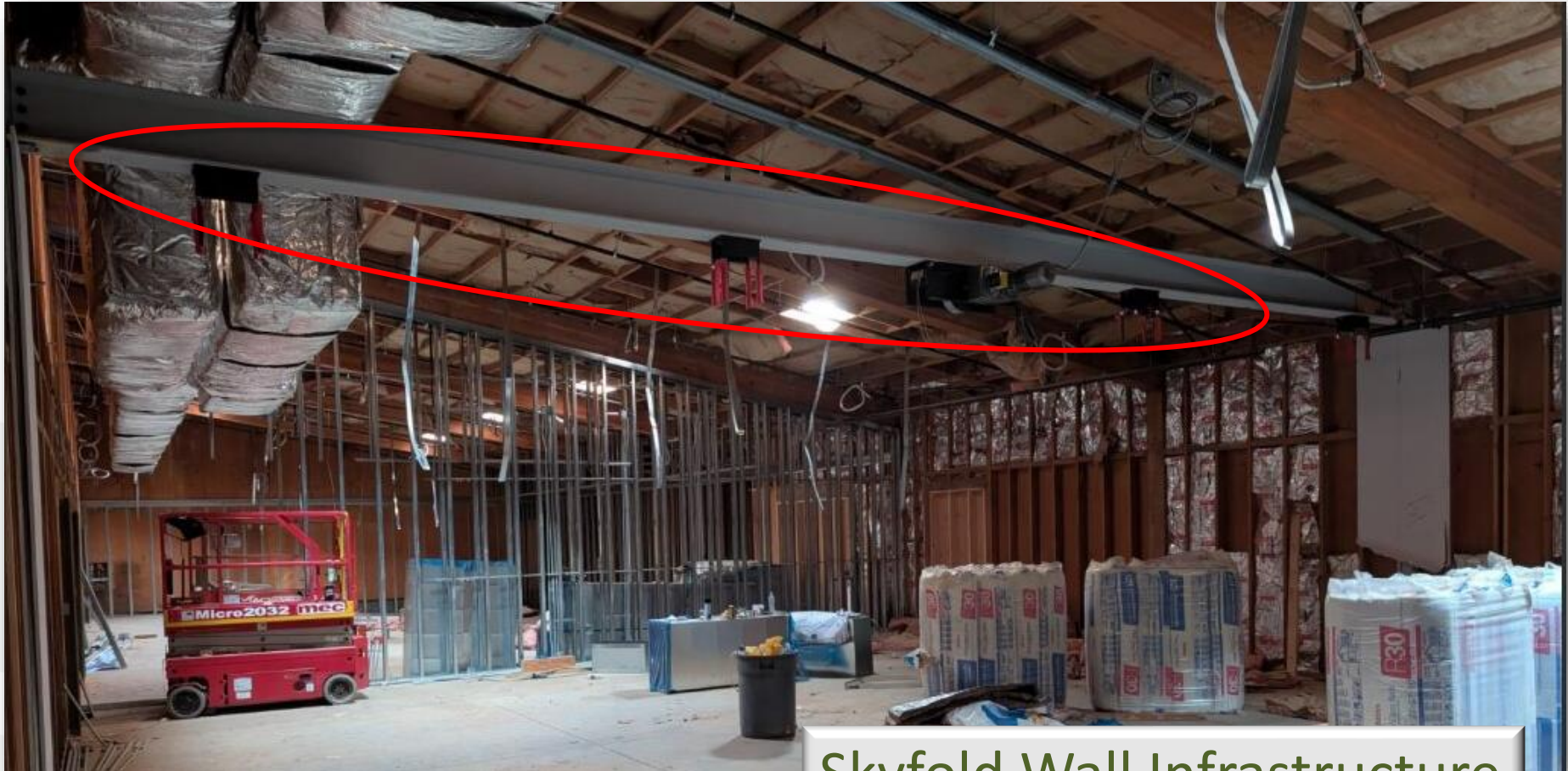
Skyfold Wall Infrastructure