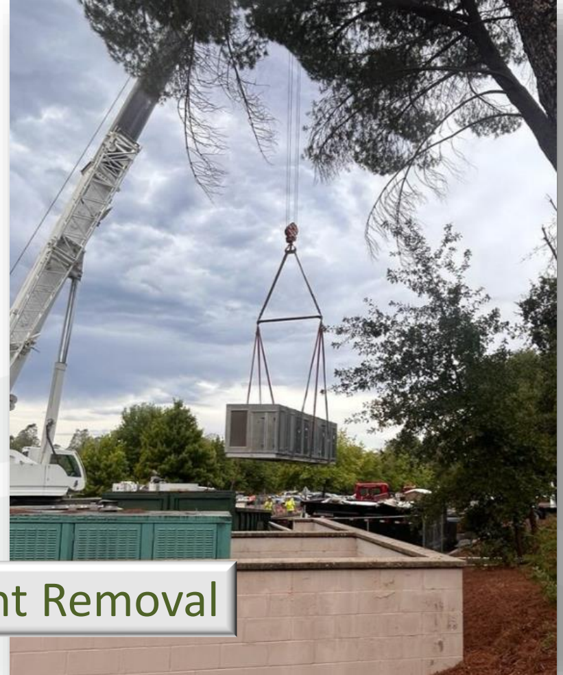
HVAC Equipment Removal