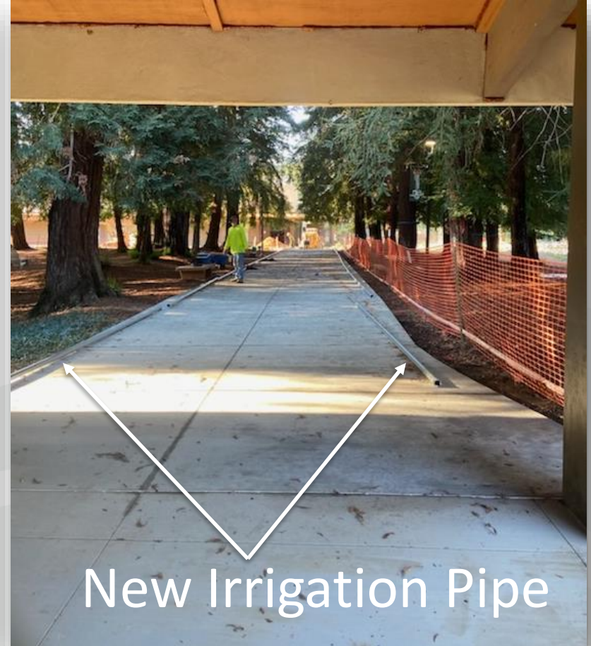
New Irrigation Pipe