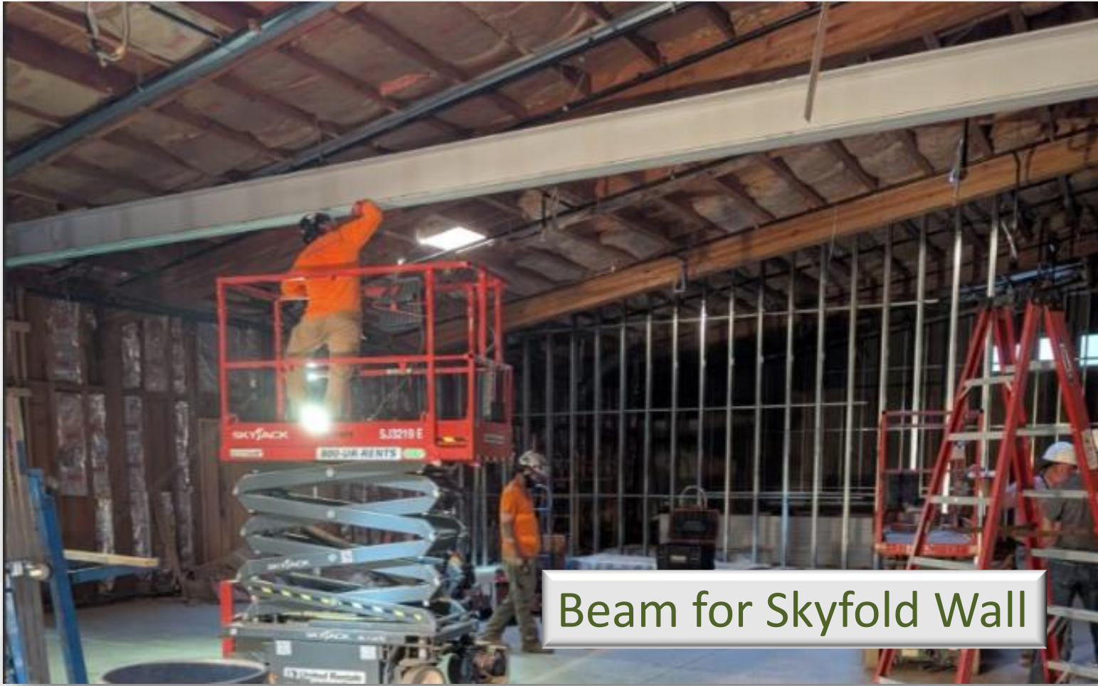
Beam for Skyfold Wall