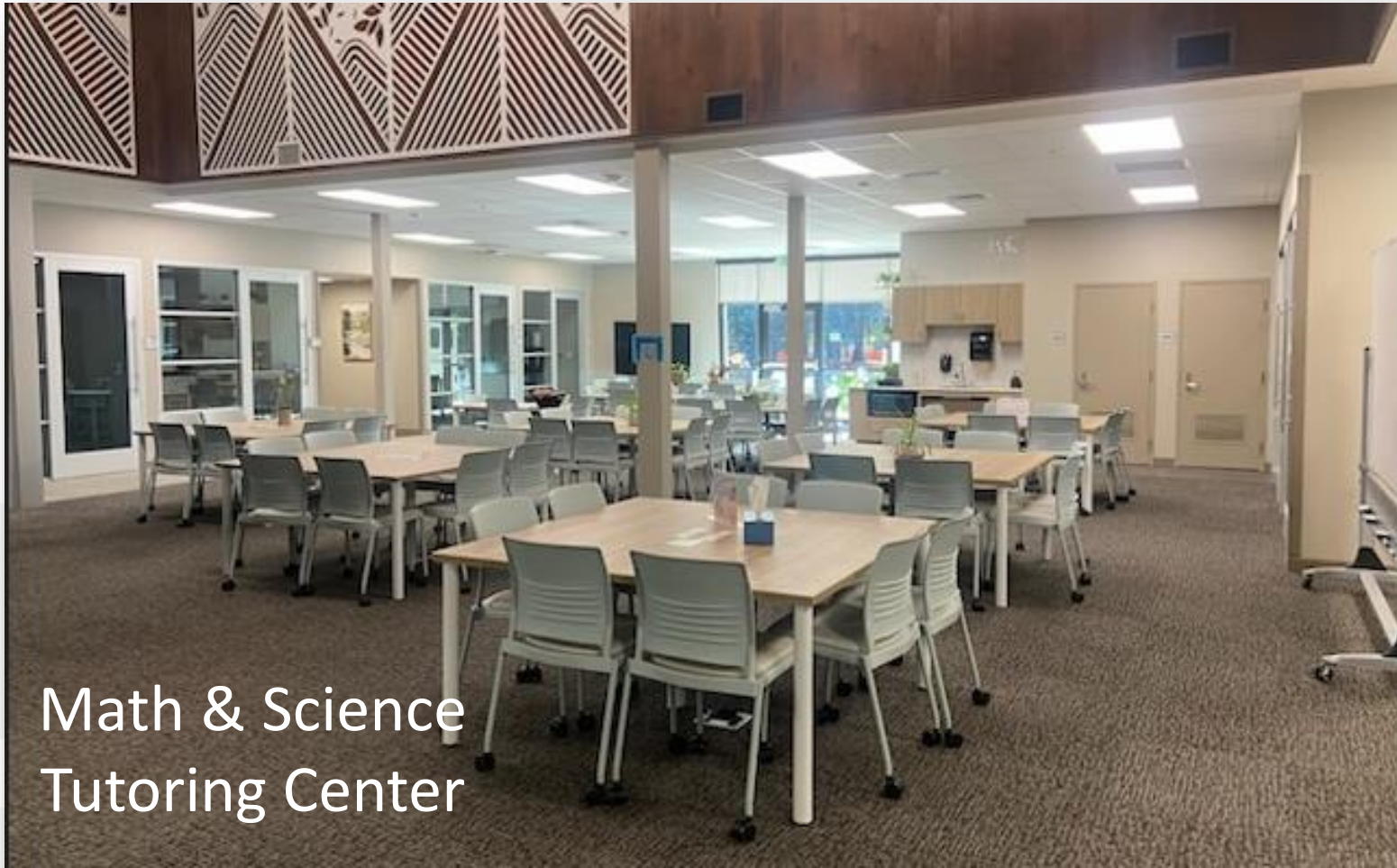
Math & Science Tutoring Center