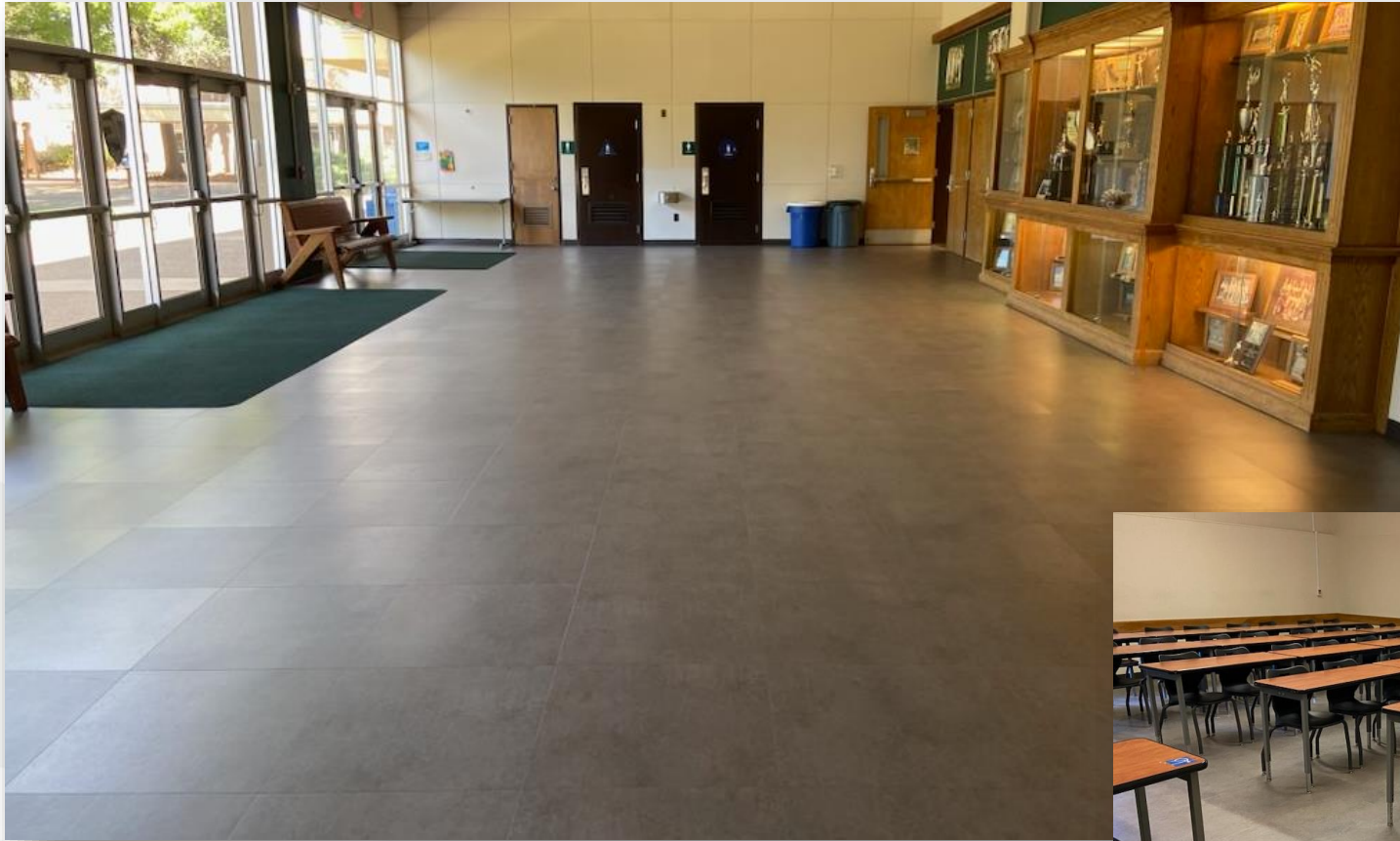
Gym Foyer Flooring Replacement