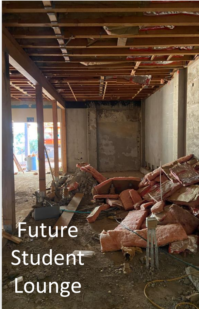
Future Student Lounge