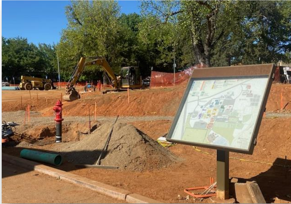
Earthwork for New Walkways from the East Parking Lot to the 800 Building