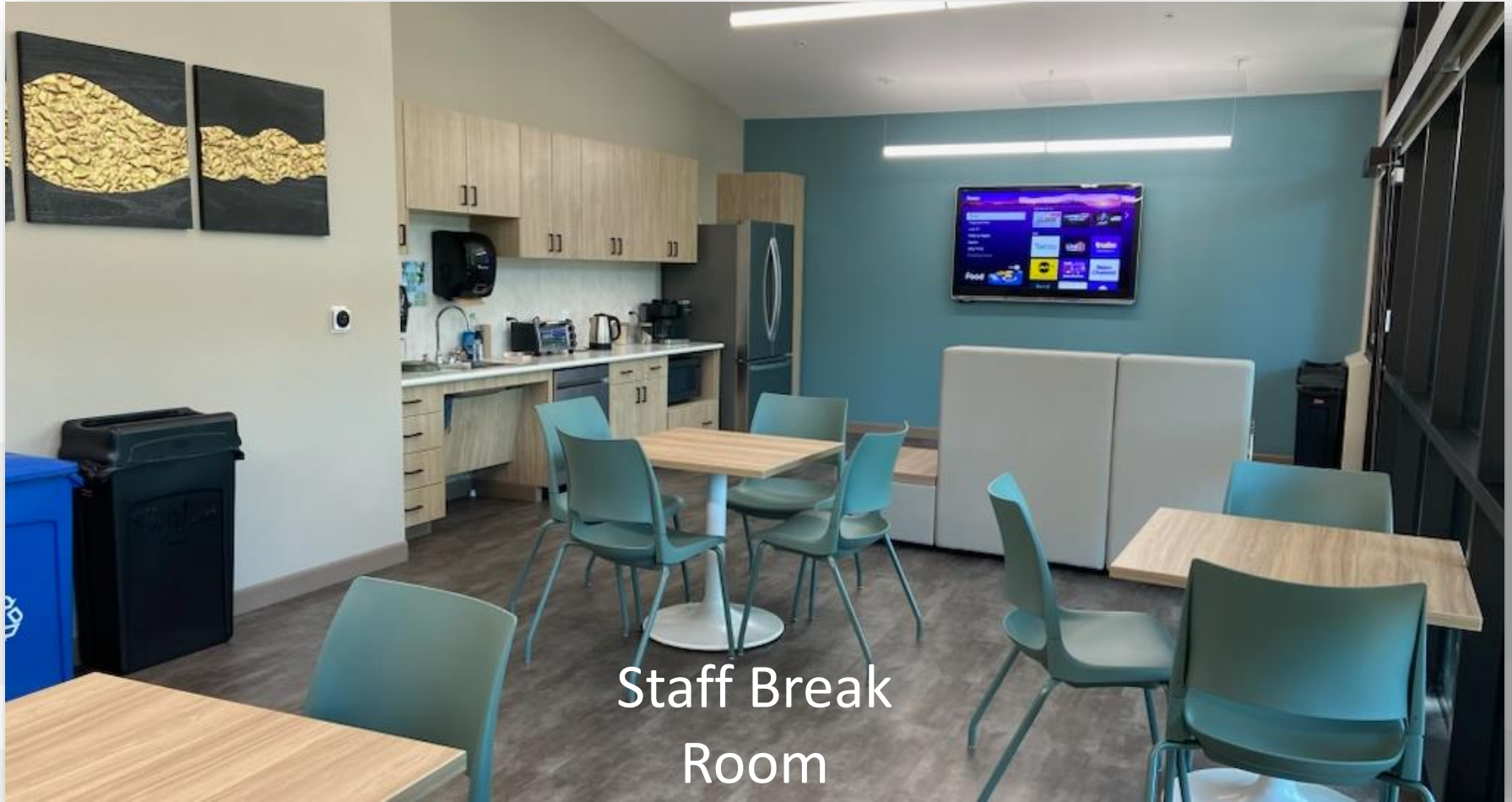
Staff Break Room