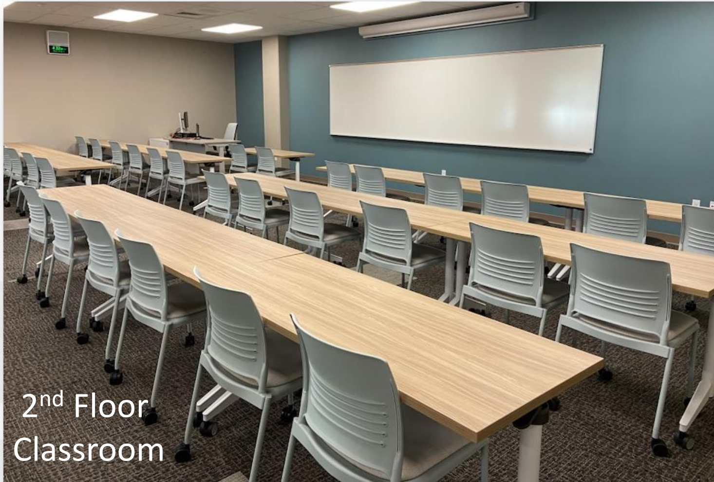
2 nd Floor Classroom