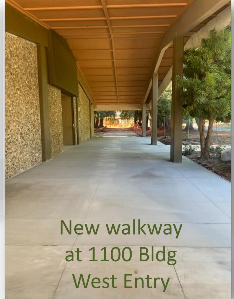
New walkway at 1100 Bldg West Entry