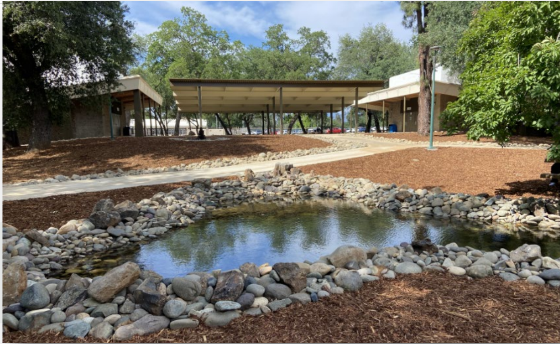
Basalt Rock Fountain adjacent to the Shade Structures