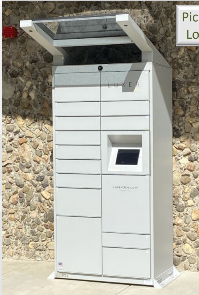
Pick Up Locker