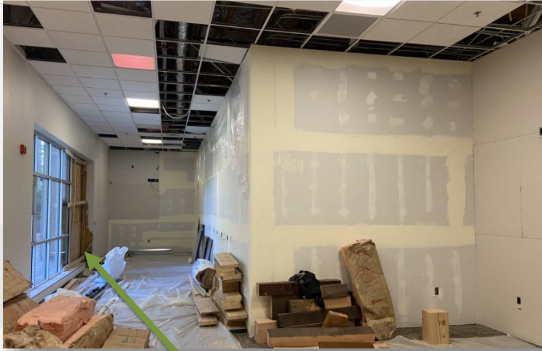
Main Entry Door to be Installed Soon