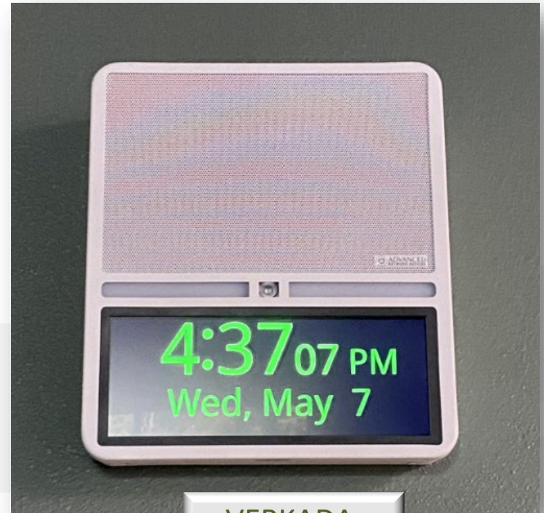
VERKADA Visual Notifier