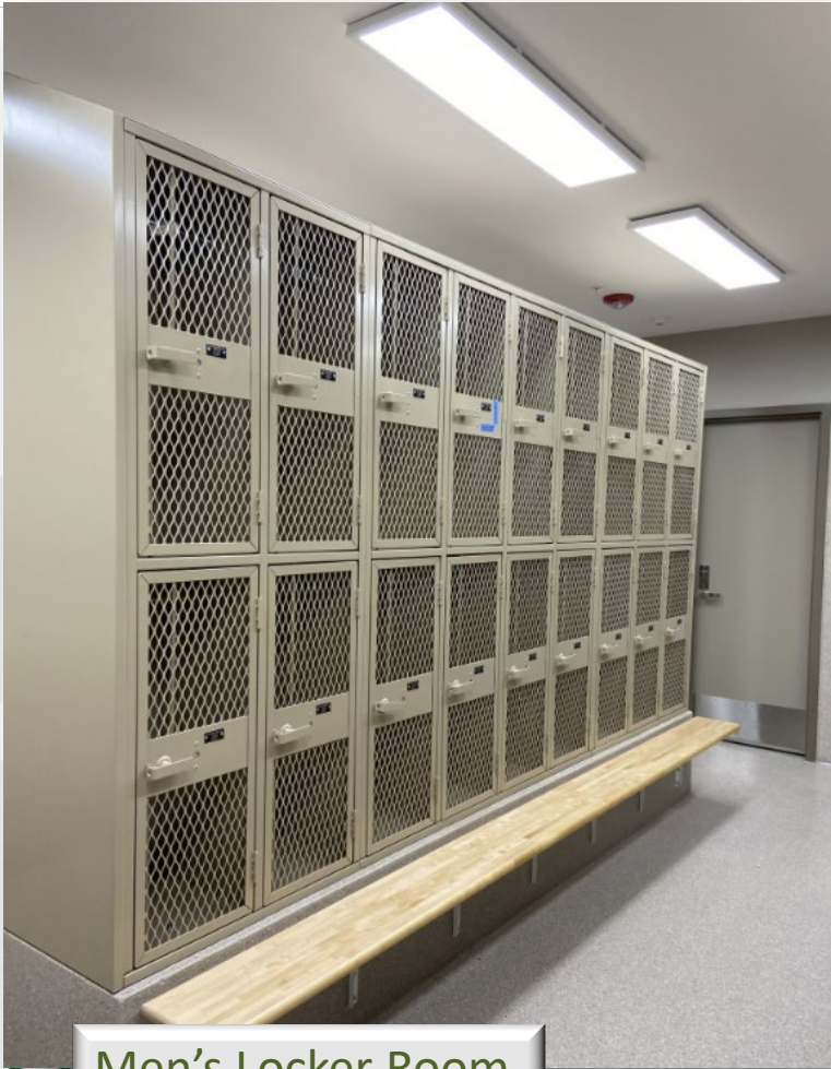
Men's Locker Room