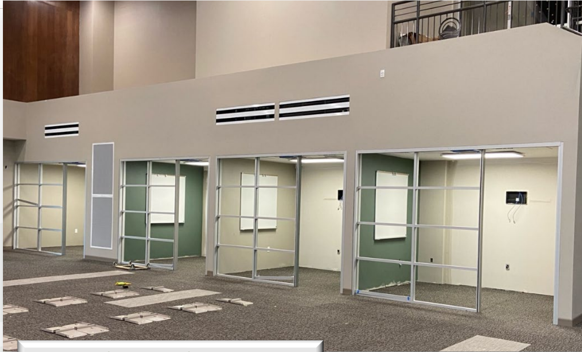
Student Study Rooms