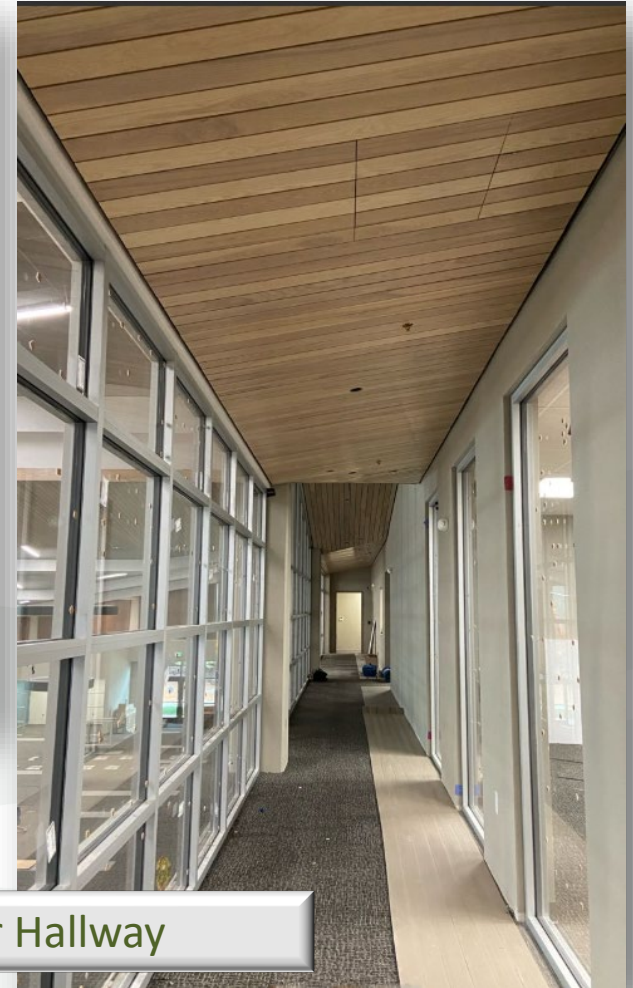
2 nd Floor Hallway