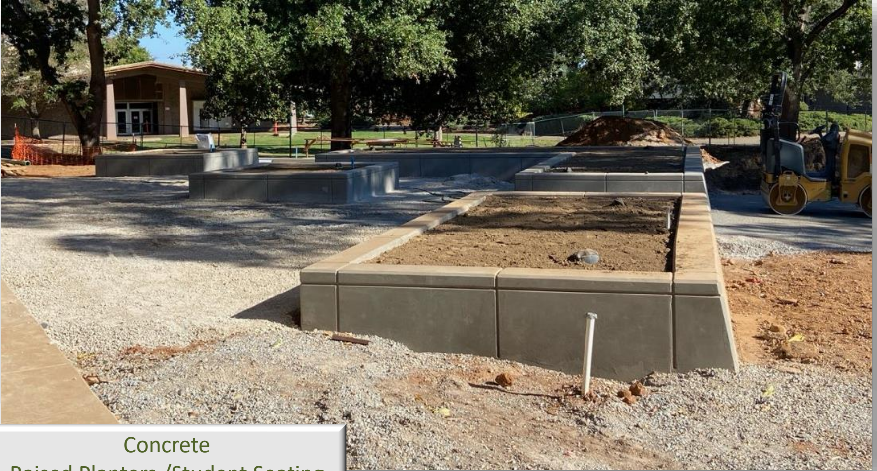
Concrete Raised Planters /Student Seating At Entry Plaza