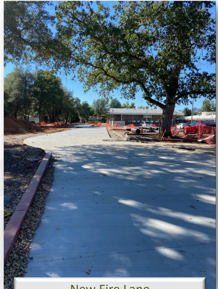
New Fire Lane