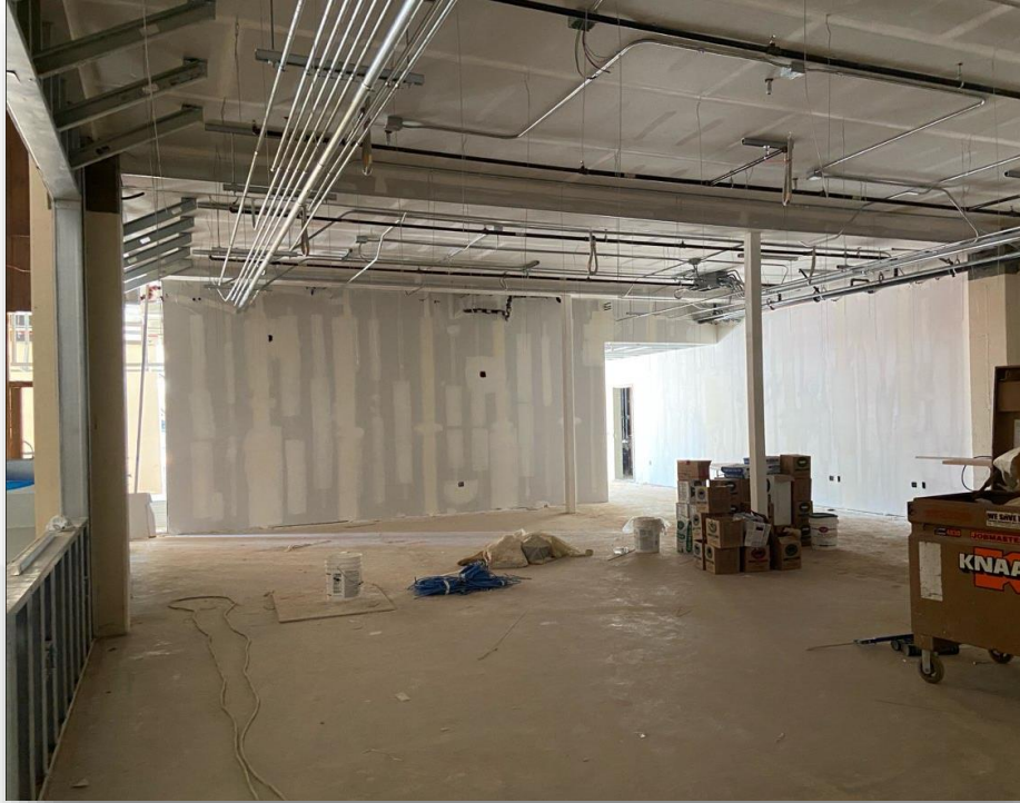
Library Instruction Classroom