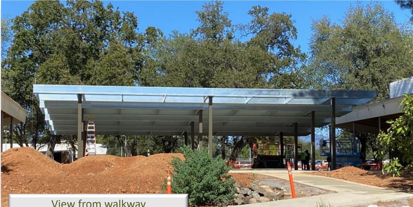
View from walkway adjacent to Library