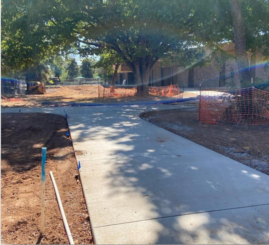
Exterior Concrete Walkways