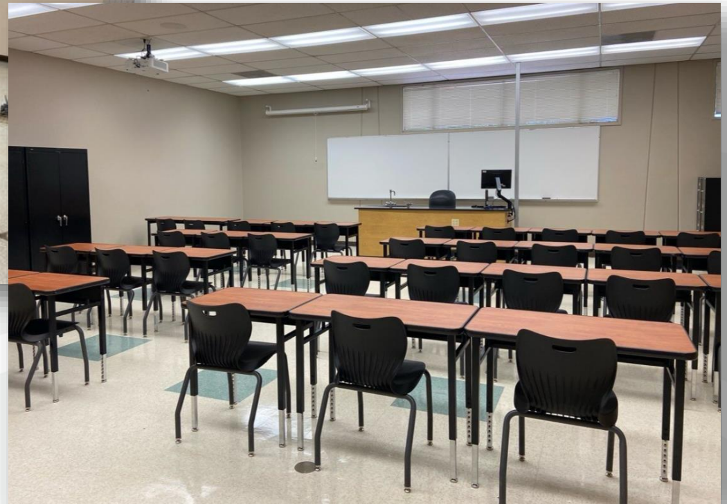
Room 1411 Before & After