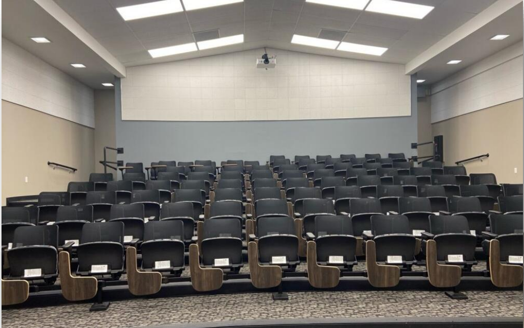
400 Building Lecture Hall