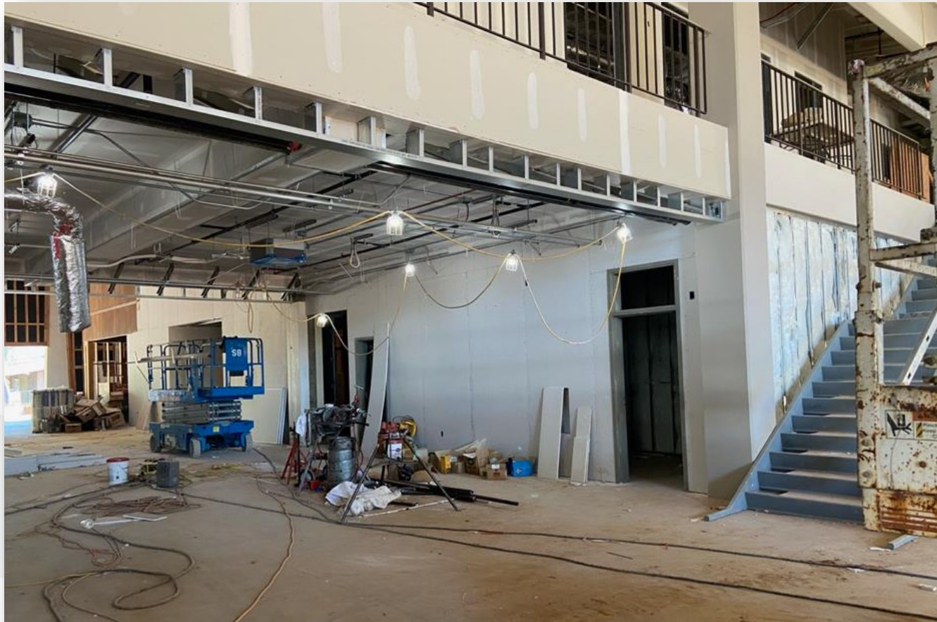
View from Stacks (Library Books) Area