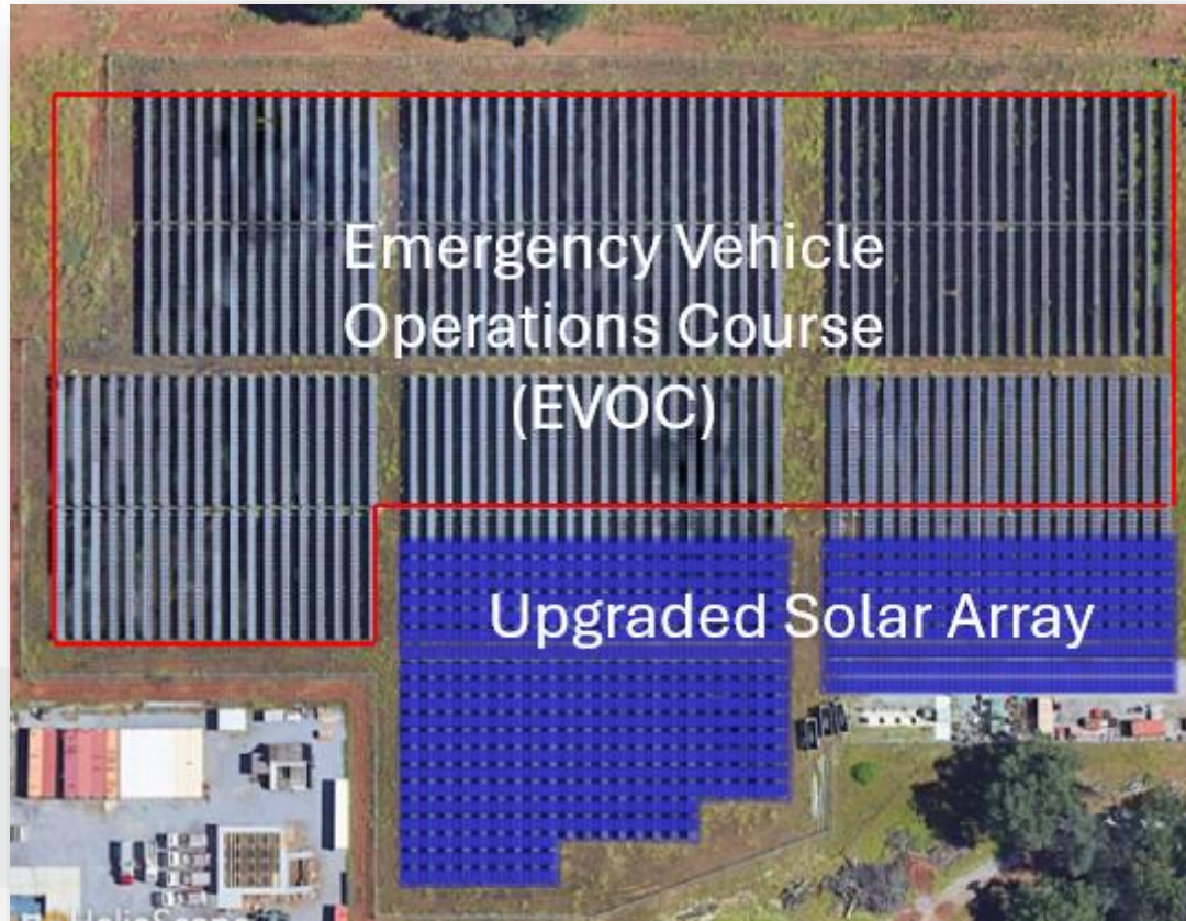
Location of Emergency Vehicle Operations Course