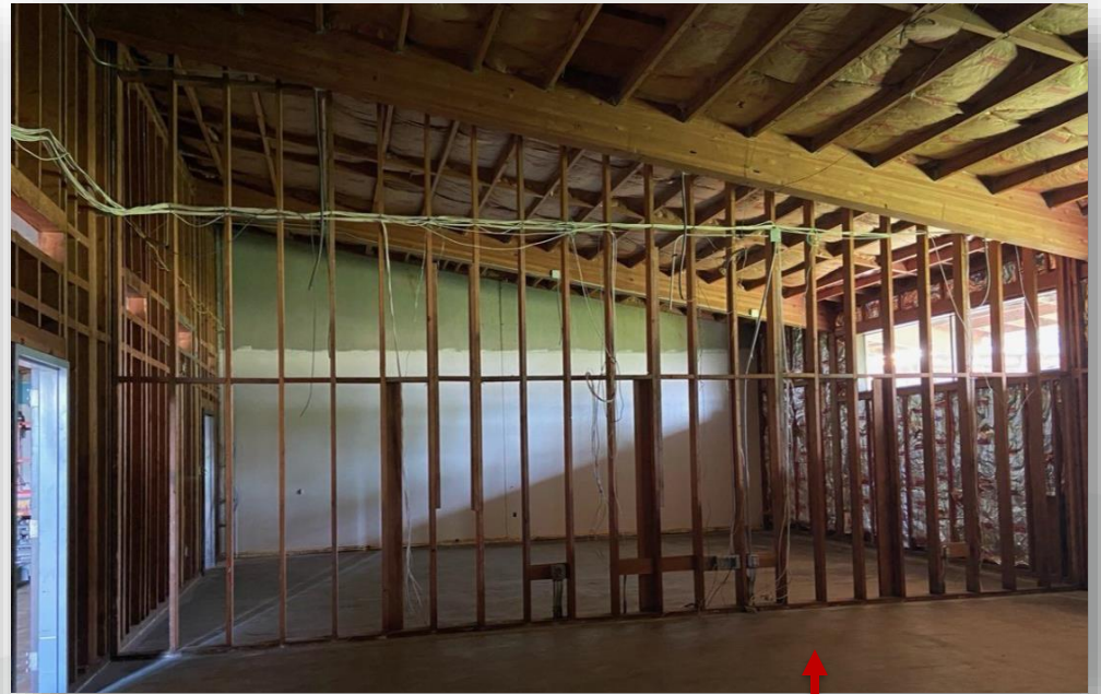
← Lecture Hall