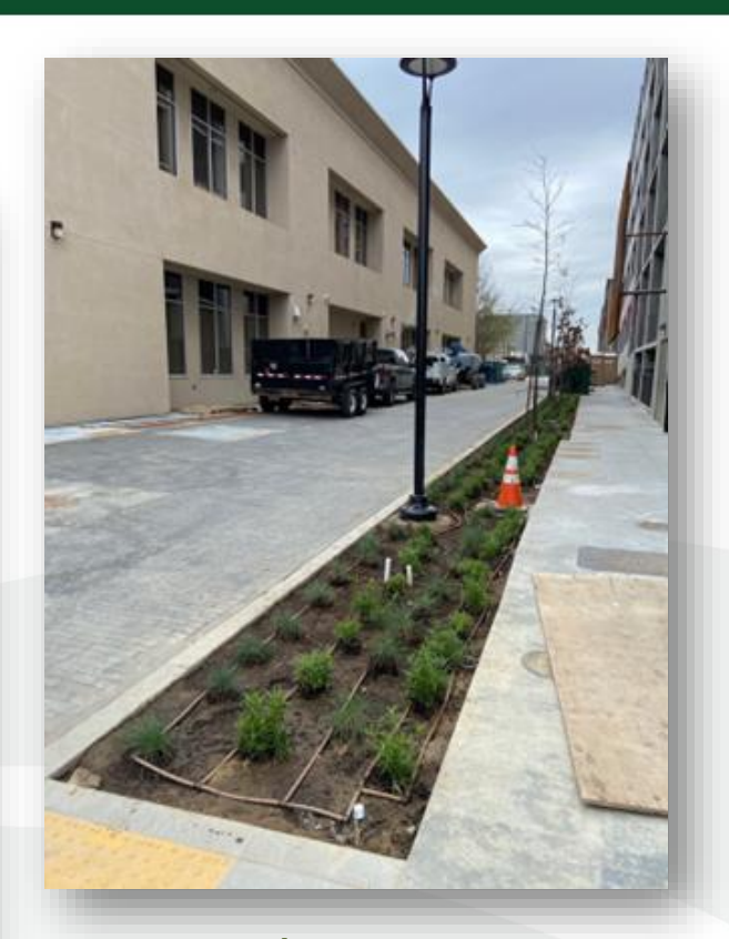
Market Street Alley