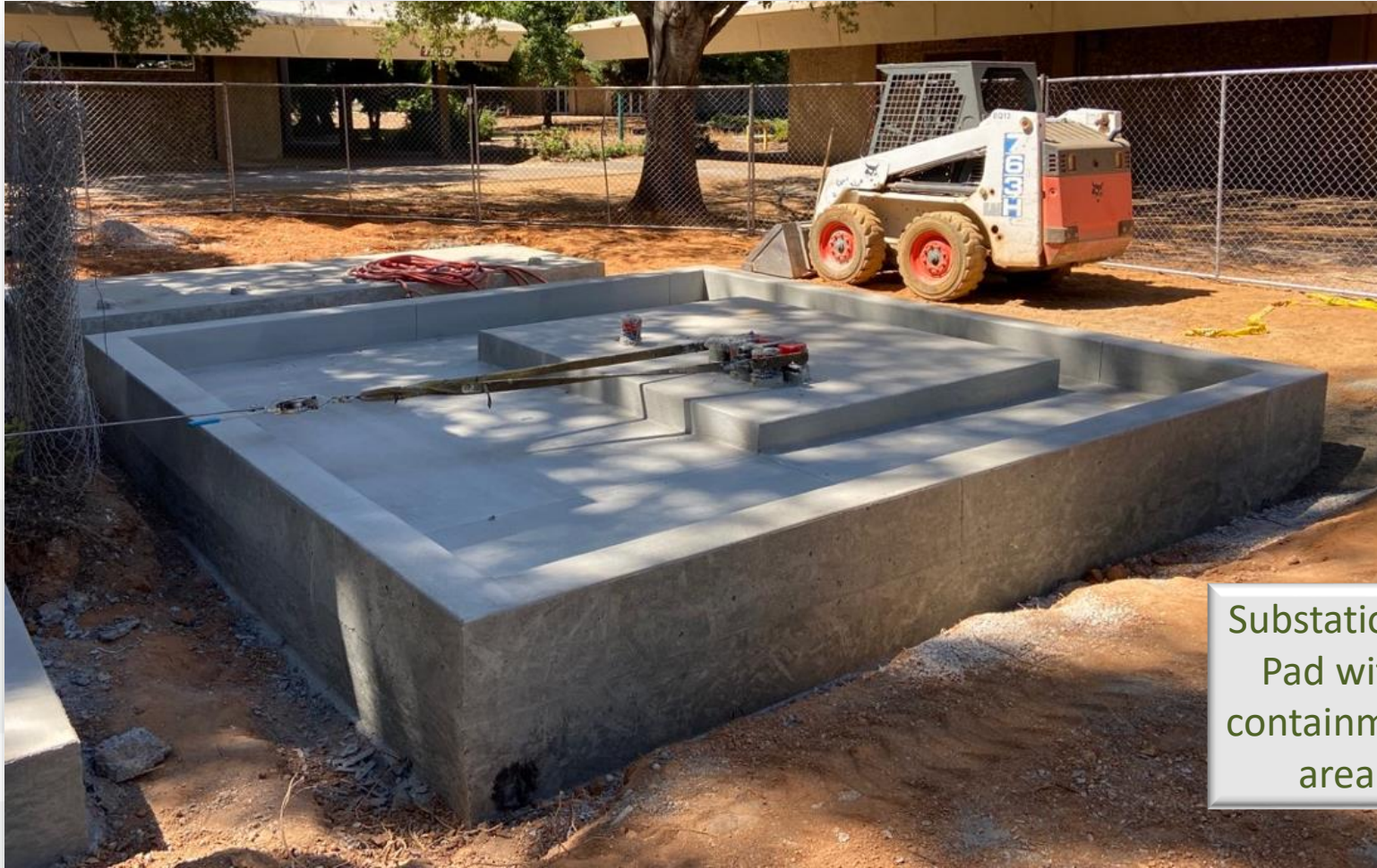
Substation C Pad with containment area