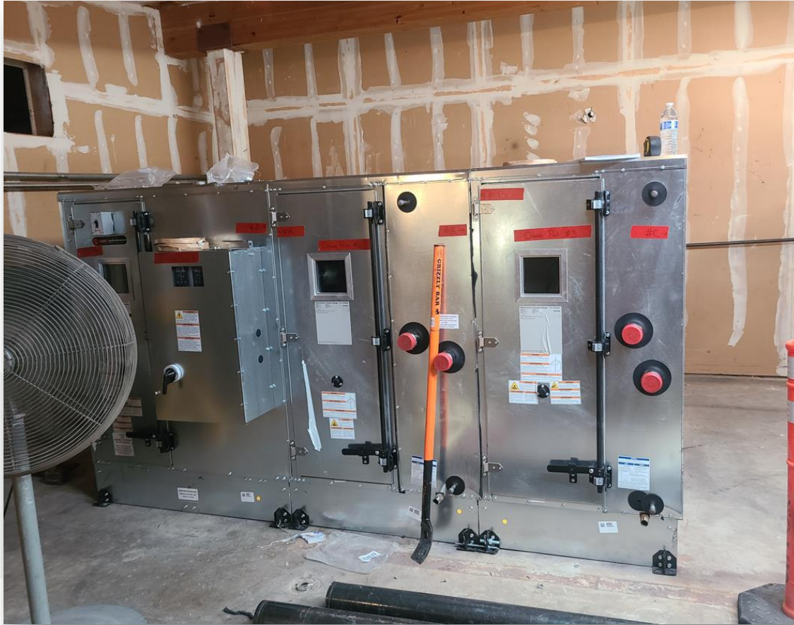
Air Handling Unit to cool the Cafeteria kitchen area