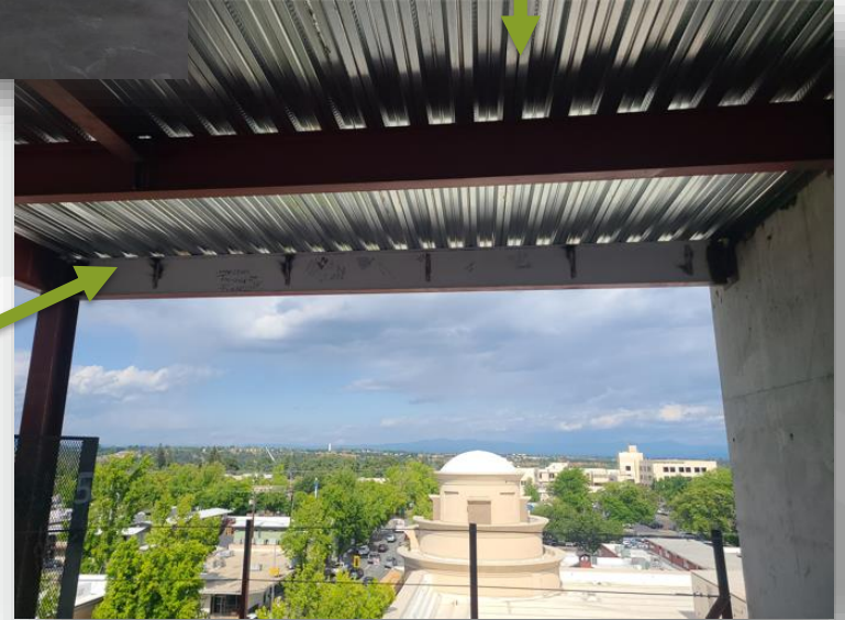
"Topping Off" Beam