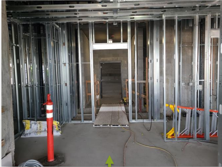
Entry into Building from Parking Garage – 2 nd Floor