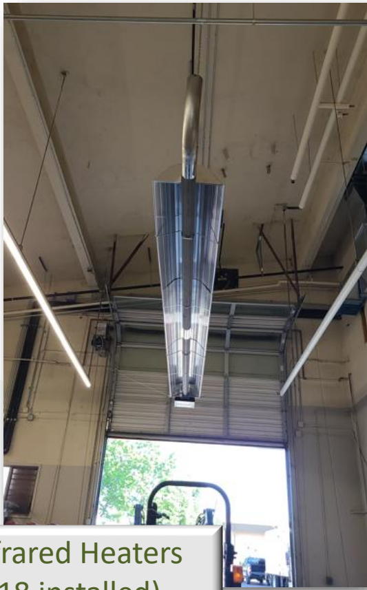
Infrared Heaters (18 installed)

$1.046 Million of HEERF Funds Supporting this Project