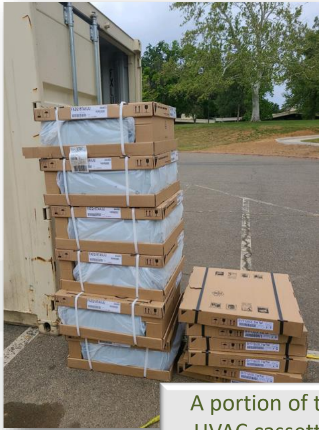
A portion of the HVAC cassettes

$1.046 Million of HEERF Funds Supporting this Project