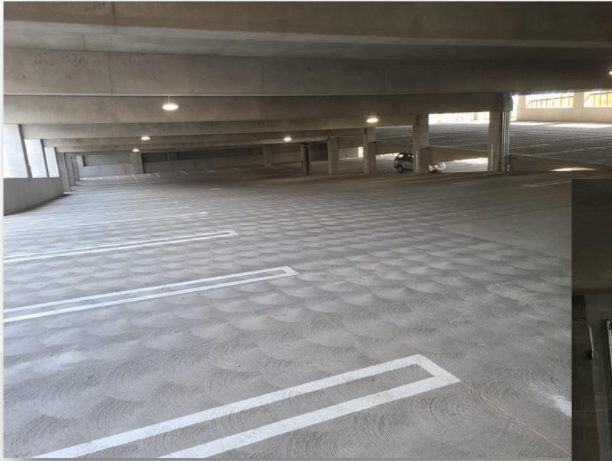
Parking Garage and Bicycle Parking – 2 nd Floor