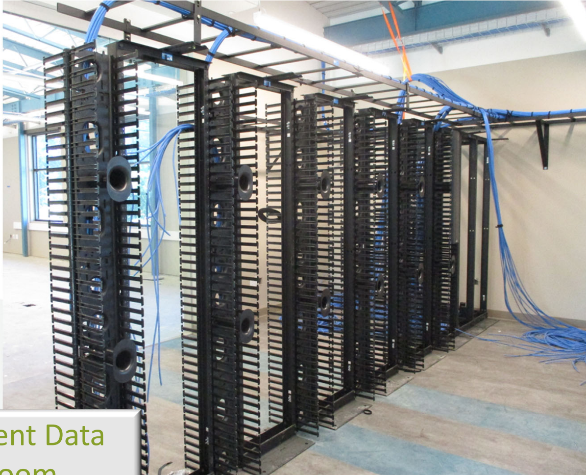
Student Data Room