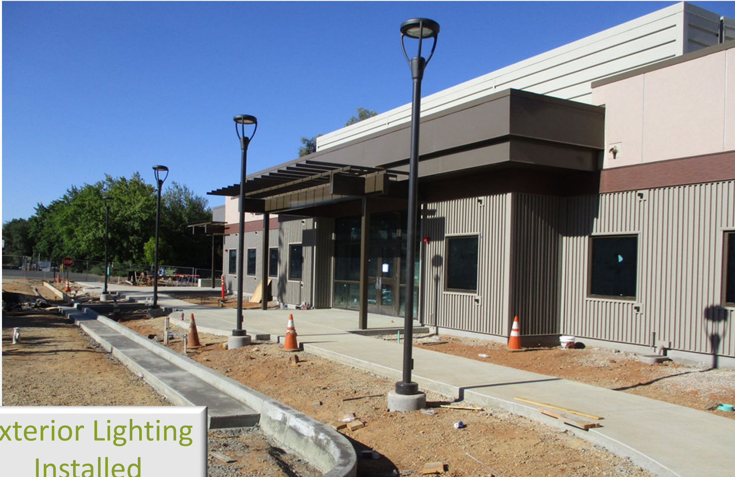
Exterior Lighting Installed