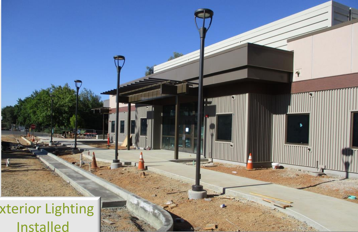
Exterior Lighting Installed