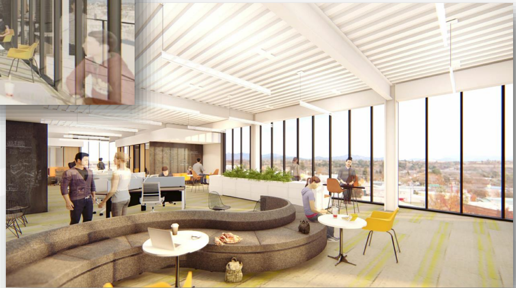
4 th Floor Rendering →