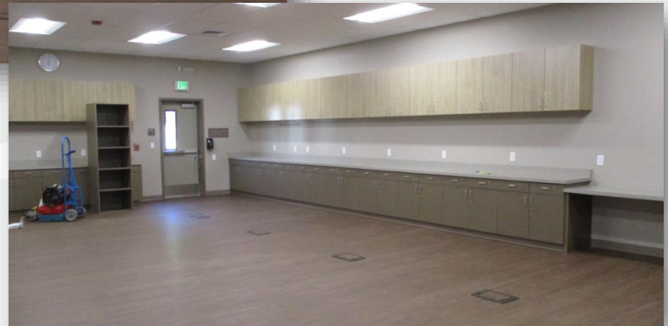
Classroom Interior →