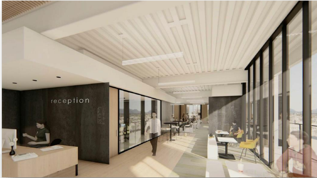
← 2 nd Floor Rendering