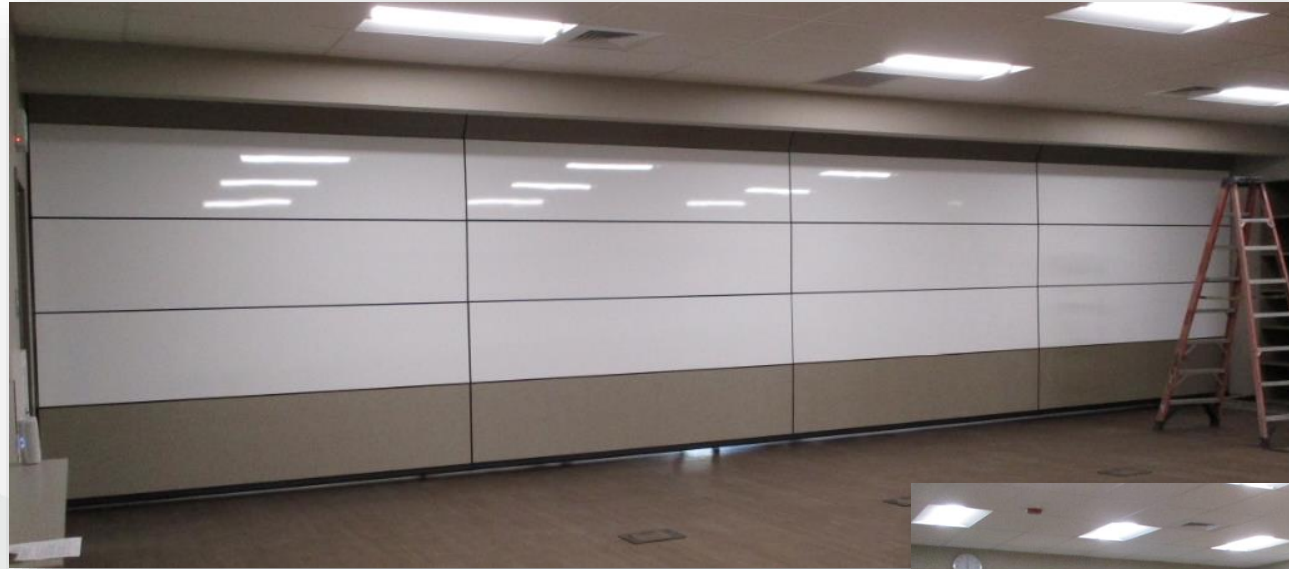
← Skyfold Wall