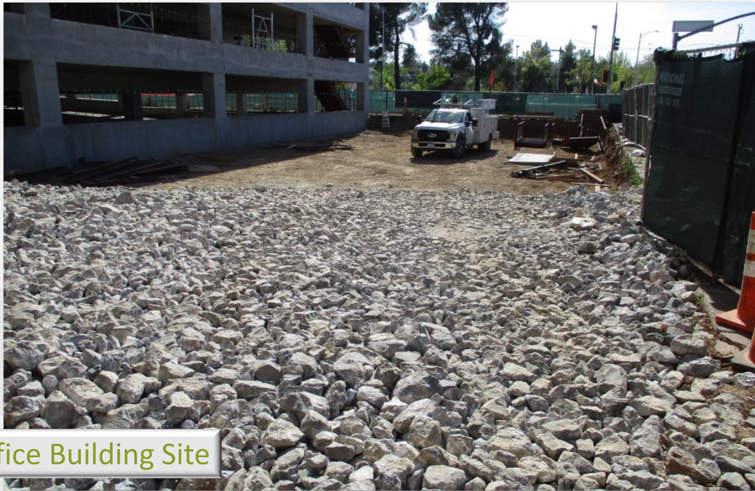
Office Building Site