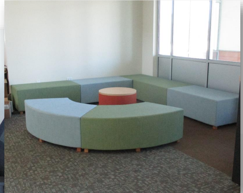
Lobby Lounge Seating