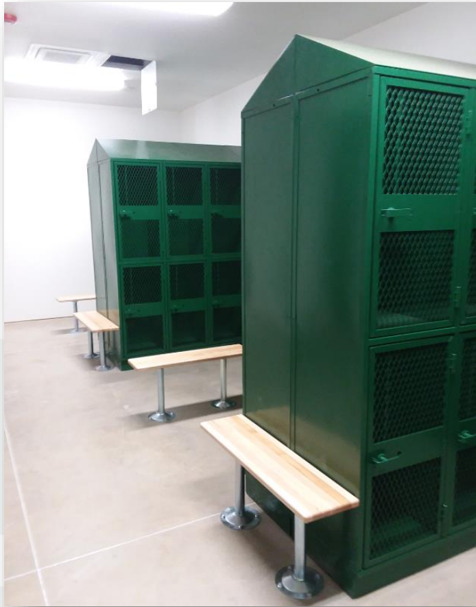
Agency Building Locker Room